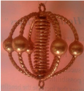
Slim's Harmonizer created from Tensor Rings and a uni-directional coil