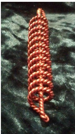
When a ring is coiled, it creates a toroidal field that extends for hundreds of yards