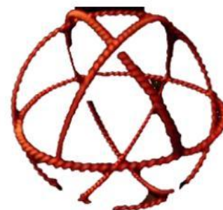
The Tensor Field Generator contains four Rings, creating a geometrical structure whose energy shines out for miles in all directions

Another beneficial use we have found for the Tensor field is in electromagnetic and geomagnetic field abatement.