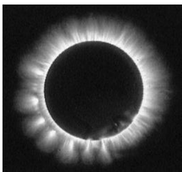
GDV Imaging of a magnet

The design of Tensor Rings is based in Sacred Geometry and ancient knowledge—intended to benefit all mankind. It is time for this knowledge to be released.